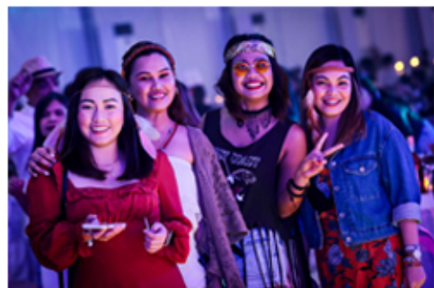
Employees in Coachella outfit attend the General Assembly held at the World Trade Center last December 14, 2022.

Patterns, florals, and feathers flooded the venue, as employees donned their best bohemian and festival outfits in the Coachella-themed event. They posed for photos and walked the red carpet leading to the massive tent along Gil Puyat Avenue.