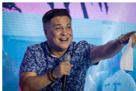
Senate President Juan Miguel “Migz” F. Zubiri, along with other senators, grace the Christmas party held at the World Trade Center.

gagawa kung wala po kayong lahat (We cannot craft laws without you)... Kayo ang tunay na puso ng Senado (You truly are the heart of the Senate),” he told the Senate employees.