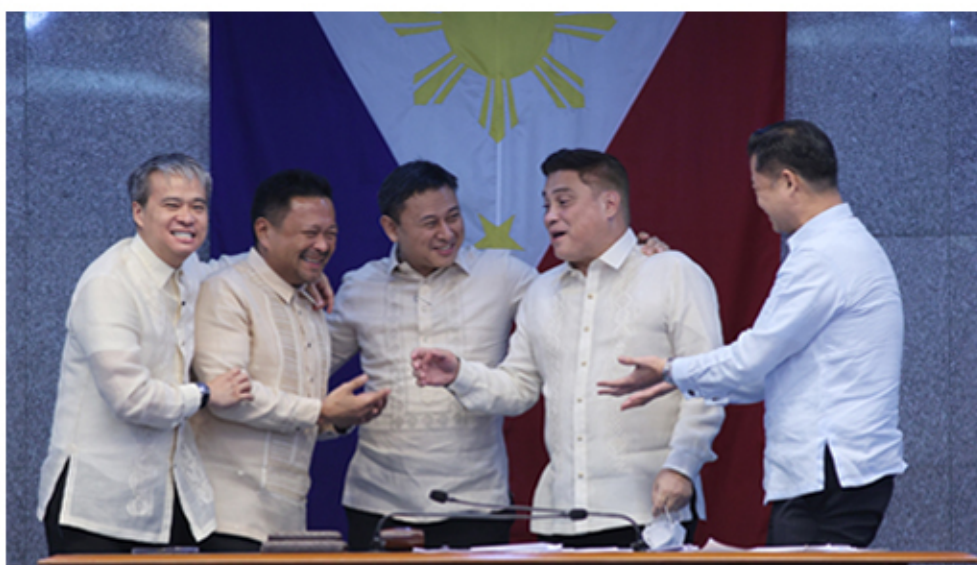
(From left) Majority Leader Joel Villanueva, Sen. Joseph Victor “JV” Ejercito, Sen. Juan Edgardo “Sonny” Angara, Senate President Juan Miguel “Migz” F. Zubiri and Sen. Win Gatchalian share a light moment during a break at a plenary session.

focus on pushing laws and policies that will help Filipinos not just to cope but also to overcome and prosper amid the challenges brought about by the COVID-19 pandemic and the global economic crisis.