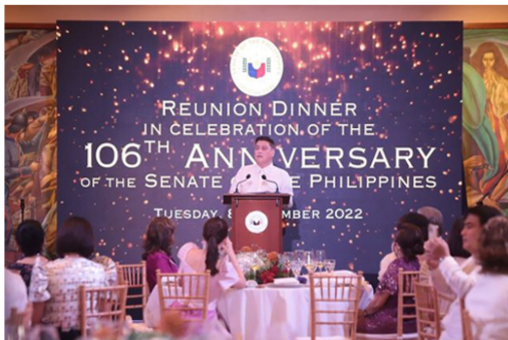
Senate President Juan Miguel "Migz" F. Zubiri delivers a welcome address during the reunion.