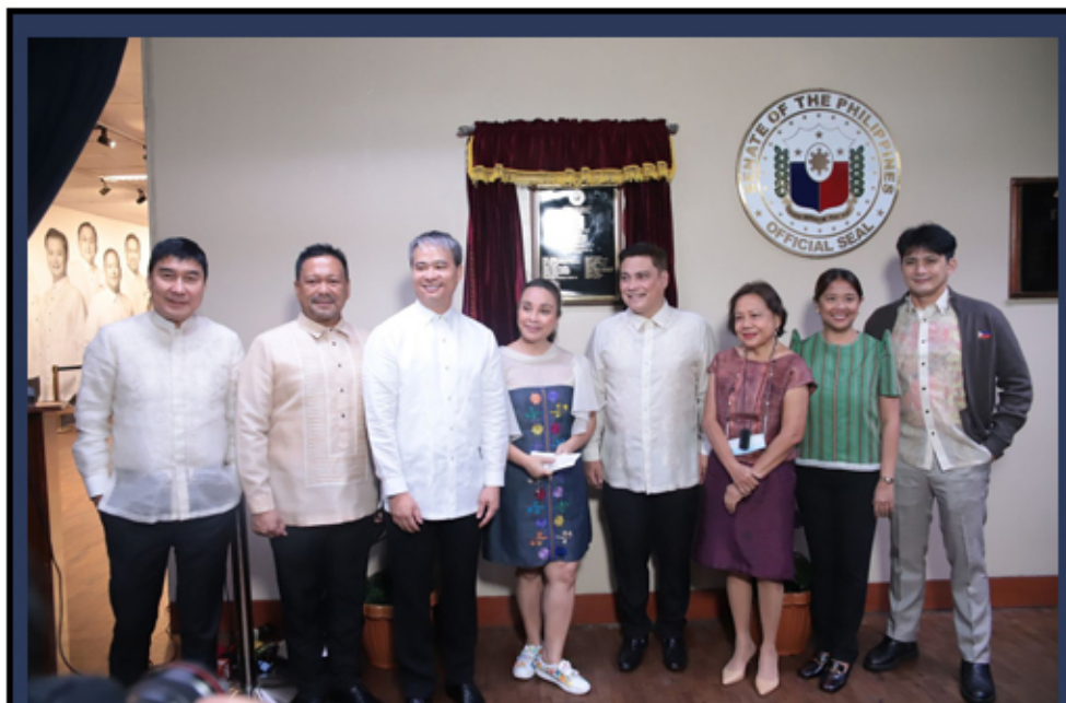
19TH CONGRESS BRASS MARKER: Senators led by Senate President Juan Miguel "Migz" F. Zubiri (5th from left) unveil the brass marker of the 19th Congress last November. The unveiling of the marker coincided with the resumption of the plenary session after a short break. The marker contains the officers and members of the 19th Congress. Also in photo are (from left) Senators Raffy Tulfo, Joseph Victor "JV" Ejercito, Senate Majority Leader Joel Villanueva, Senate President Pro Tempore Loren Legarda, Cynthia Villar, Nancy Binay and Robinhood Padilla.

"This pandemic was really a tough examination which tested us in every aspect of our lives, but if we continue to keep our doors open to new things, new learnings and shift our perspective into a more constructive and productive side, we will pass this exam with overwhelming victory," he added.