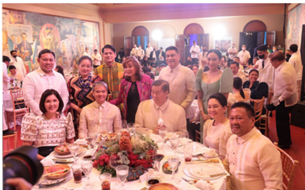
Past and current senators during the 106th anniversary reunion held at the National Museum in Ermita, Manila.

the debacles and hardships every Filipino faces, their indomitable spirit would help surmount the odds.