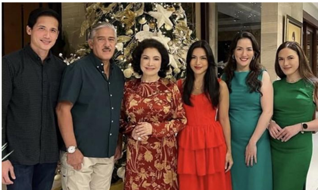
Former Senate President Vicente Sotto III and his family

Senator Vicente C. Sotto III, the 23 rd senate president, was described by his colleagues as a consensus builder, a leader by example, and a master of parliamentary procedures and Rules of the Senate. His experience in legislation—being a former Quezon City vice mayor who presided the City Council, minority leader, and majority leader—helped him to smoothly lead and navigate the Senate as a legislative body.