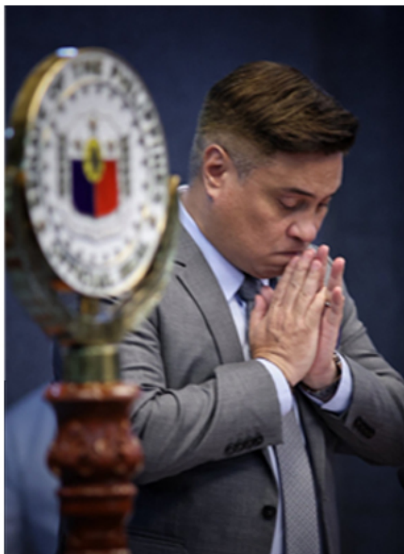
Senate President Juan Miguel “Migz” F. Zubiri bows his head in prayer before the start of the plenary session.

will actively exercise its oversight functions over government activities and use of public funds “not to encroach on the executive branch but to help government remedy deficiencies in the delivery of public services and recalibrate ineffective policies.”