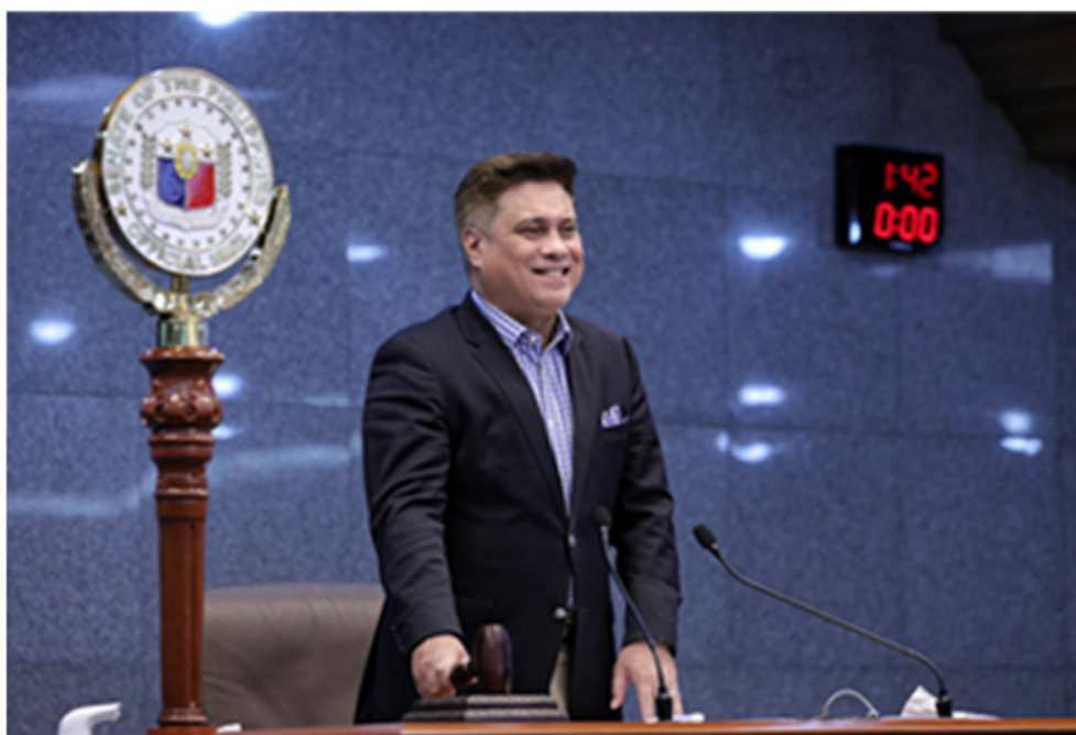
Senate President Juan Miguel “Migz” F. Zubiri presides over a plenary session.

Zubiri said the “Senate for National Reconstruction will