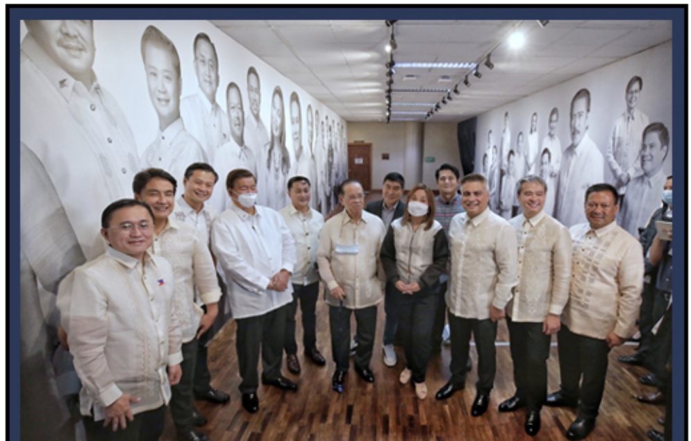
19th CONGRESS LEGACY WALL UNVEILED: Senate President Juan Miguel "Migz" F. Zubiri leads senators in unveiling the legacy wall last October. The 19.97 x 3.13-meter mural installed at the second floor of the Senate building in Pasay City features the 24 senators of the 19th Congress. "This wall celebrates the power of the people, people who chose us to work for them and to advocate for them in these halls. Remember, ladies and gentlemen, this is not our Senate, this is your Senate. It is the people's Senate. When we look at this wall, may we be constantly reminded of our duty to our people," Zubiri said during the unveiling ceremony. The activity was part of the month-long celebration of the 106th anniversary of the Senate. Also present during the ceremony were Senate President Pro Tempore Loren Legarda, Majority Leader Joel Villanueva and Senators Christopher Lawrence "Bong" Go, Win Gatchalian, Joseph Victor "JV" Ejercito, Ramon Bong Revilla Jr., Francis "Tol" Tolentino, Robinhood Padilla and Raffy Tulfo. Former Senate President Franklin Drilon and former Sen. Francisco "Kit" Tatad also graced the occasion.

Villanueva graduated with a degree in Commerce, major in economics, at the University of Santo Tomas. He also took special studies in Business Administration at Harvard University. In addition, the Polytechnic University of the Philippines conferred on him the Doctor of Humanities, honoris causa .