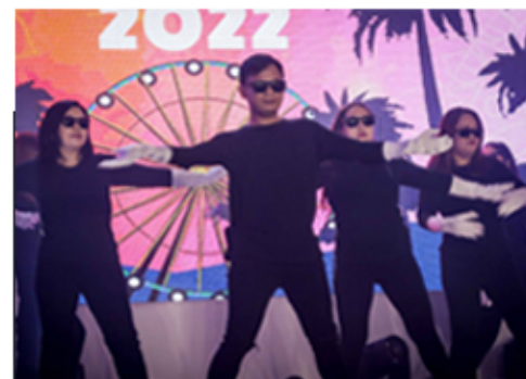
Finalists in the TikTok contest dance to the cheering crowd.

The Public Relations and Information Bureau’s (PRIB) distinctive door design emerged as the winner of the Door Decor contest. A mixed media of handwoven mat, used boxes, paper scraps, paint, and meticulously glued indigenous textiles, twines, and strings that featured the nativity of Christ and employees’ loved ones, showcased the ingenuity of the decorators.