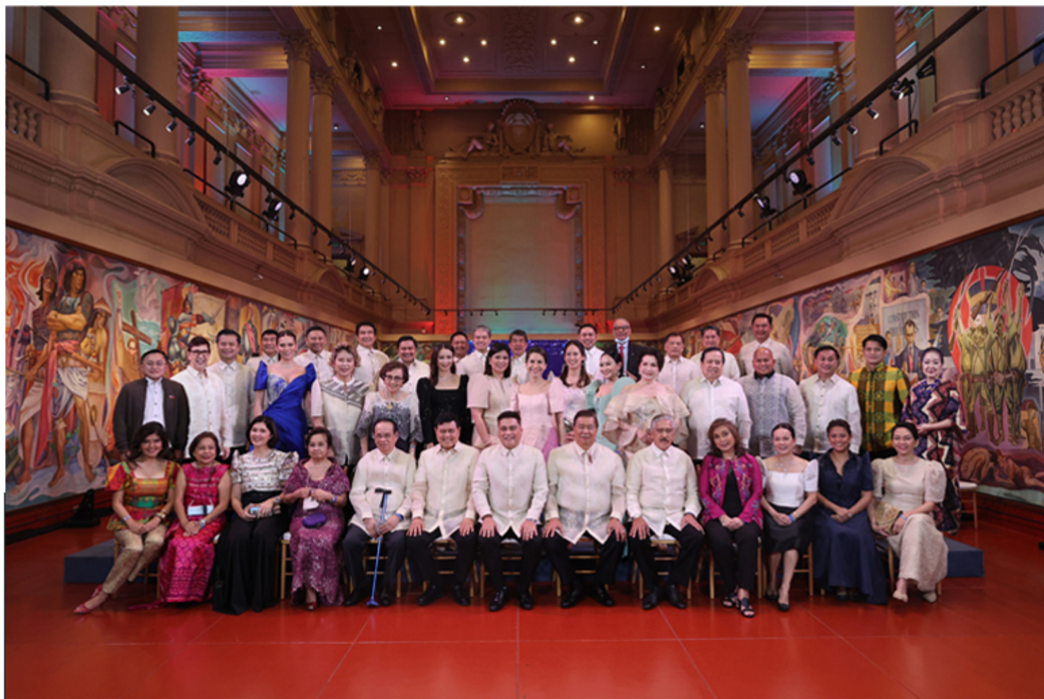
Past and current senators pose at the gallery of the National Museum in Ermita, Manila.

As the past and present senators started arriving inside the historic National Museum, a strong sense of nostalgia swept those who were present during the Senate 106th Anniversary Dinner Reunion last November 8, 2022.