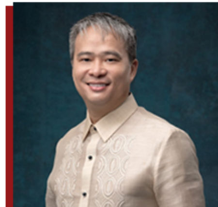
HON. LOREN LEGARDA Senate President Pro Tempore

"When they saw the star, they rejoiced exceedingly with great joy." (Matthew 2:10)