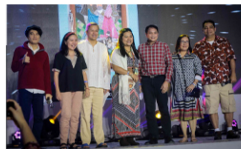
Officers of the Public Relations and Information Bureau accept the prize for the Best Door Décor contest.

Another highlight was the announcement of victors in the Christmas competitions that employees and offices have worked for days before the event.