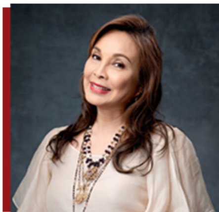
HON. JUAN MIGUEL "MIGZ" F. ZUBIRI Senate President

A merry and blissful Christmas to all our reliable and hardworking Senate employees and staff! As the Senate