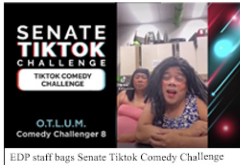
EDP staff bags Senate Tiktok Comedy Challenge

claiming the top prize. During the party, members of the “Team Tulfo in Action” wowed the crowd as they grooved to a remix of Ariana Grande’s Last Christmas and other Tiktok beats.