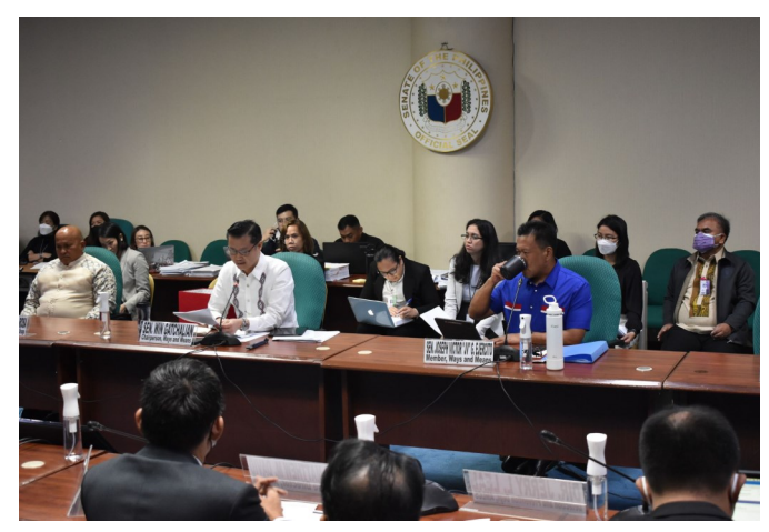
On January 23, 2023, the Committee on Ways and Means conducted the 4th Public Hearing for general Inquiry, in aid of legislation, to measure economic costs and benefits of POGO operations under Republic Act No. 11590 vis-a-vis its social costs.

Based on submitted data of concerned agencies involving POGOs, in-depth research, and testimonies during public hearings, relevant information came out which are significant in the preparation of the Committee Report on said resolutions. This paper discusses in brief how the POGO industry operates under existing laws and regulations; tax regime governing POGOs; revenues generated by the government from POGOs; income arising from allied industries that sprung around POGOs and their contribution to the Philippine economy. Several important observations are also raised.