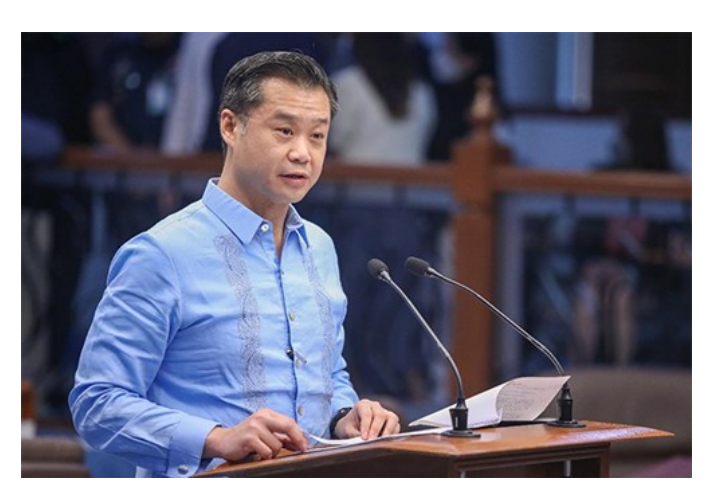
On February 22, 2023, Senator Win Gatchalian, Chairperson of the Committee on Ways and Means, called for the investigation of the contract of Philippine Amusement and Gaming Corporation (PAGCOR) with Global COMRCI, a third-party auditor, on the alleged underreporting of Philippine Offshore Gaming Operators (POGOS) revenues.

shall engage the services of a third-party audit platform that would determine the GGR or receipts of offshore gaming licensees. The third-party auditor shall be independent, reputable, internationallyknown, and duly accredited as such by an accrediting or similar agency recognized by industry experts. 11