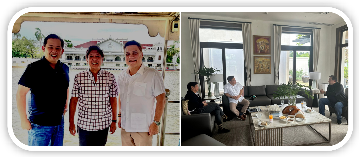
Left: Photo from the official Facebook page of Senate President Migz Zubiri; and Right: Photo from the official Facebook page of Presidential Communications Office.