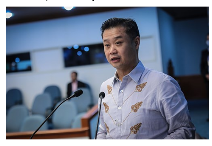
On February 7, 2023, Senator Win Gatchalian, Chairperson of the Committee on Ways and Means, delivered his sponsorship of Senate Bill No. 1806 or The Taxpayer's Bill of Rights and Obligations Act.

ed rights would prompt taxpayers to dutifully comply with their tax obligations and to observe regulations that are implemented by revenue authorities.