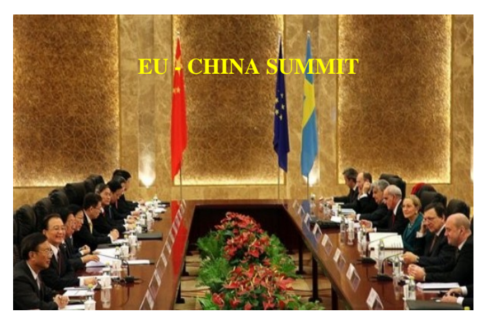
EU trade with China, an enigma

The initial signals aren't encouraging. At the weekend ASEAN summit in Hua Hin, Thailand, delegates discussed regional integration, climate change and removing trade barriers. No less than five ASEAN nations - Burma, Cambodia, Laos, the Philippines and Singapore - refused to meet with civil society representatives during a scheduled Friday "interface meeting" meant to act as a forum for discussion between heads of state and civil society representatives ... '