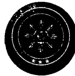
FERDINAND ROMUALDEZ MARCOS JR. President of the Philippines