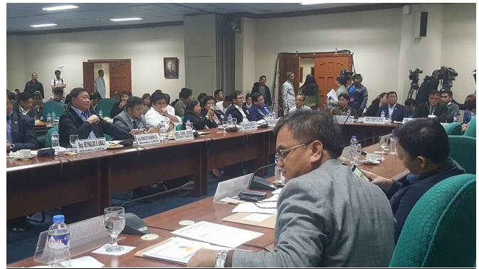
Organizational Meetings of the Joint Congressional Oversight Committees on TIMTA, ODA, CMTA and CTRP.

With various jurisdictions around the world confirming the need to close the gap between sales transactions from points of sales and its transmission