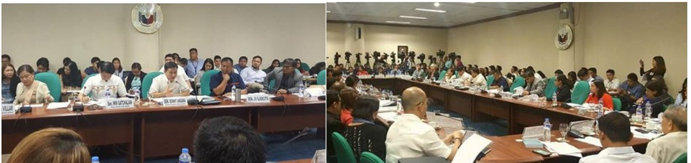
July 12, 2017 - 10th Public Hearing on Value-Added Tax Provisions "Tax Reform for Acceleration and Inclusion"

In photos: Sen. Loren Legarda, Sen Win Gatchalian, Sen. Sonny Angara, Chairperson, Ways & Means, and Atty. Rodelio Dascil, Director General of STSRO.