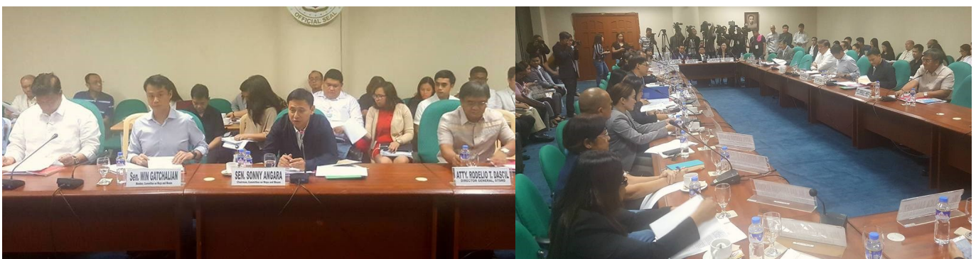
July 6, 2017 - Public Hearing of the Senate Committee on Ways and Means on the Estate Taxes, Donor's Taxes and Imposition of 8% GRT on Self-employed and Professionals.