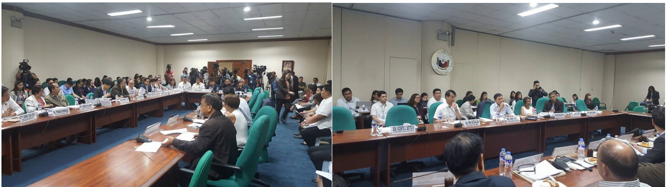
August 2, 2017 - 12th Public Hearing on Tax Reform for Acceleration and Inclusion (TRAIN) bills