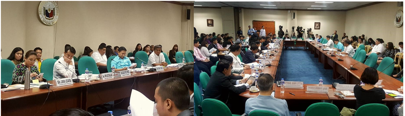
July 26, 2017 - 11th Public Hearing on Deliberation/Discussion on the Administrative Provisions Under the "Tax Reform for Acceleration and Inclusion"(TRAIN) Bills.