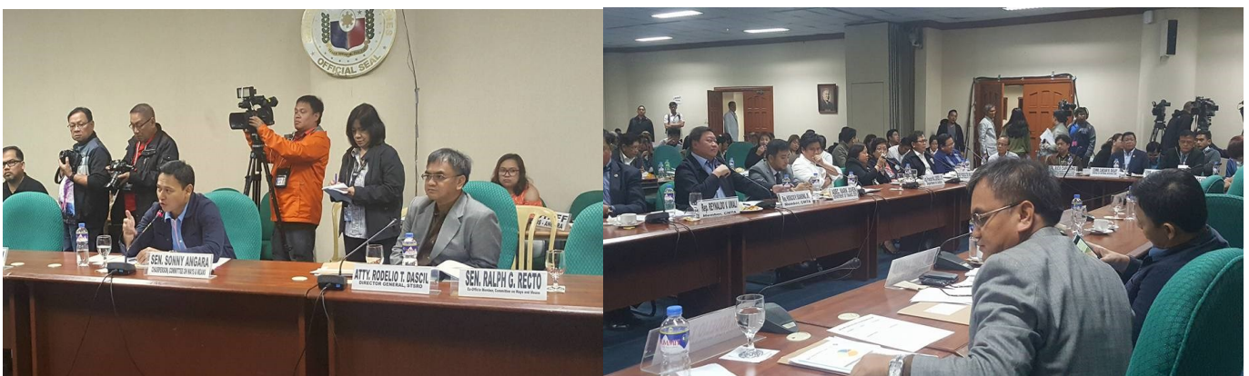
July 27, 2017 - Organizational Meetings of the Joint Congressional Oversight Committees on TIMTA, ODA, CMTA and CTRP