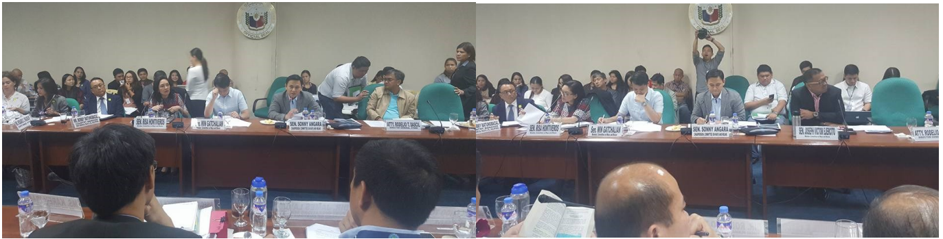
August 10, 2017 - 13th Public Hearing on "Tax Reform for Acceleration and Inclusion" (TRAIN) Bills HBN 5636 and SBN 1408 focusing on Petroleum Products.