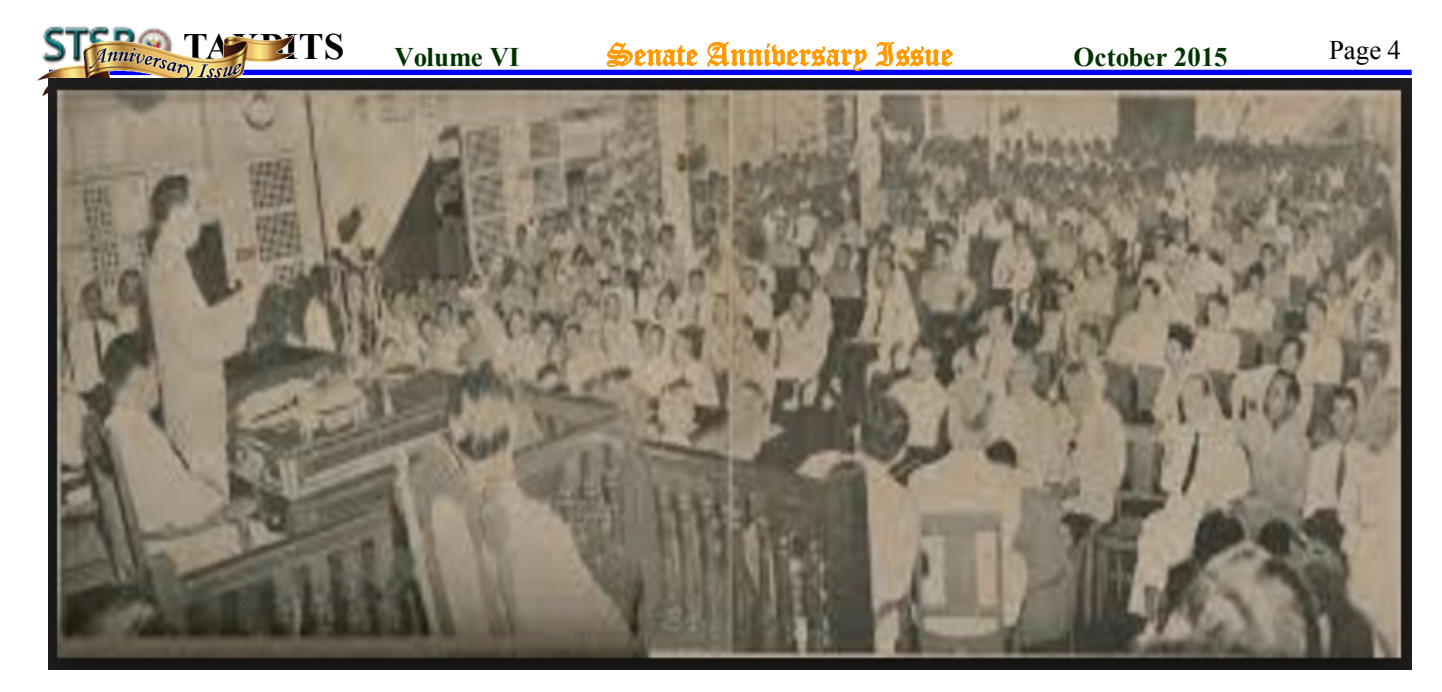
President Manuel Roxas's First State of the Nation Address delivered at the Temporary Congress building, (http://www.gov.ph/the-state-of-the-nation-address-traditions-and-history/)

independence fueled the strategic partnership between the Filipino elite and the various grassroots movements that contributed to the unique character of Filipino politics from the halls of the Assembly to the floor of the future Senate. Eventually, the silhouette of a bicameral legislative process between the Philippine Commission which served as the upper chamber and the Philippine Assembly as the lower house became evident.<sup>2</sup>