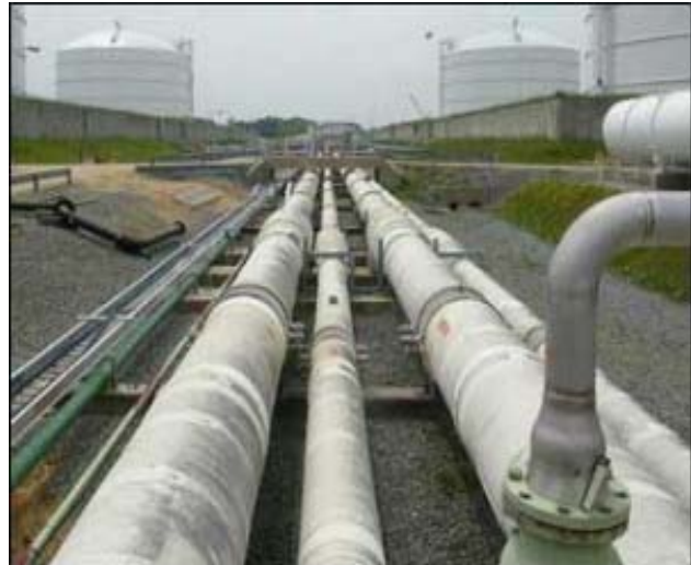
Subic-Clark pipeline 7

As an estimate, replacing the oil pipeline or an oil barge will require an equivalent of over 10-20 tank lorries traversing our Southern Luzon Expressway (SLEX) from the Shell Batangas refinery and Caltex Batangas international terminal as well as our Northern Luzon Expressway (NLEX) from the Petron Bataan Refinery..."