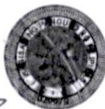
BENIGNO S. AQUINO III President of the Philippines