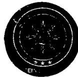
FERDINAND ROMUALDEZ MARCOS JR. President of the Philippines