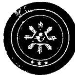
FERDINAND ROMUALDEZ MARCOS JR. President of the Philippines