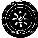
FERDINAND ROMUALDEZ MARCOS JR. President of the Philippines