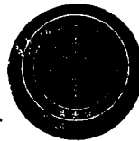
FERDINAND ROMUALDEZ MARCOS JR. President of the Philippines